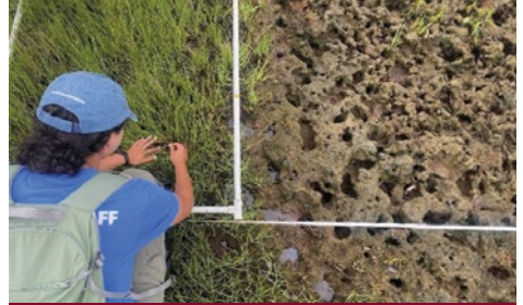
Jisun Reiner, Coastal Ecology Research Technician, monitoring vegetation and salt marsh health at an NCF salt marsh.

This year we continued outreach projects to encourage the use of native plants for landscaping on Nantucket. Using native plants in our home and business landscapes increases habitat for native wildlife and provides resilience to climate change, but people often find it difficult to imagine the rewards of a native plant garden. NCF's office landscaping continued to evolve with the addition of new plantings and plant species signs in the wildflower meadow. New ecology outreach programming this year helped make native plants more accessible to our members with a second season of popular native garden tours at the NCF office. We also hosted botanically focused educational